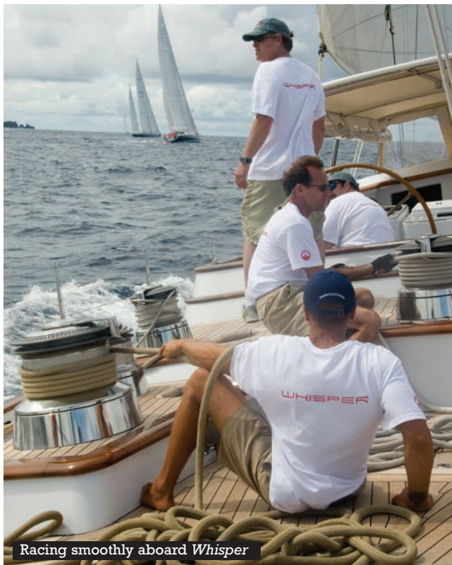
Racing smoothly aboard Whisper