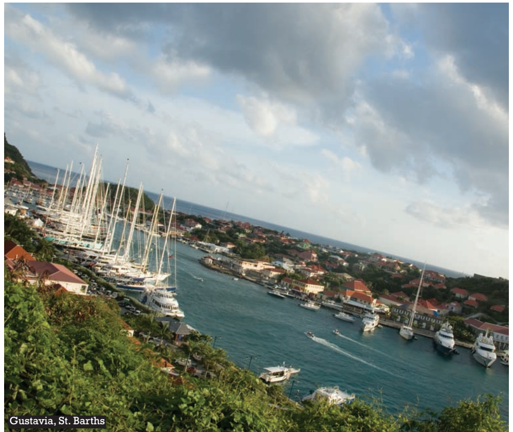
Gustavia, St. Barths

Friday's "Around the Island Race" began with a lovely 14-knot breeze out of the northeast – and as I had been receiving updates from weatherguru.com for about a month, I speculated it was only going to get better. I scoped my options out carefully and though it was a difficult choice – with the expected collection of the gorgeous "regular crowd", in addition to an enticing selection of new beauties including the unmistakable neon aqua-colored 104-foot Gliss from Royal Huisman/Briand. For obvious reasons, I jumped aboard 116-foot Whisper , unquestionably and consistently the most fun boat. Though the Rebecca crew may have deservedly won the "Cool