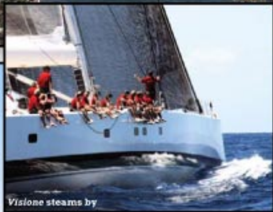
Visione steams by