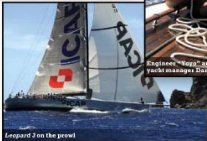
Leopard 3 on the prowl