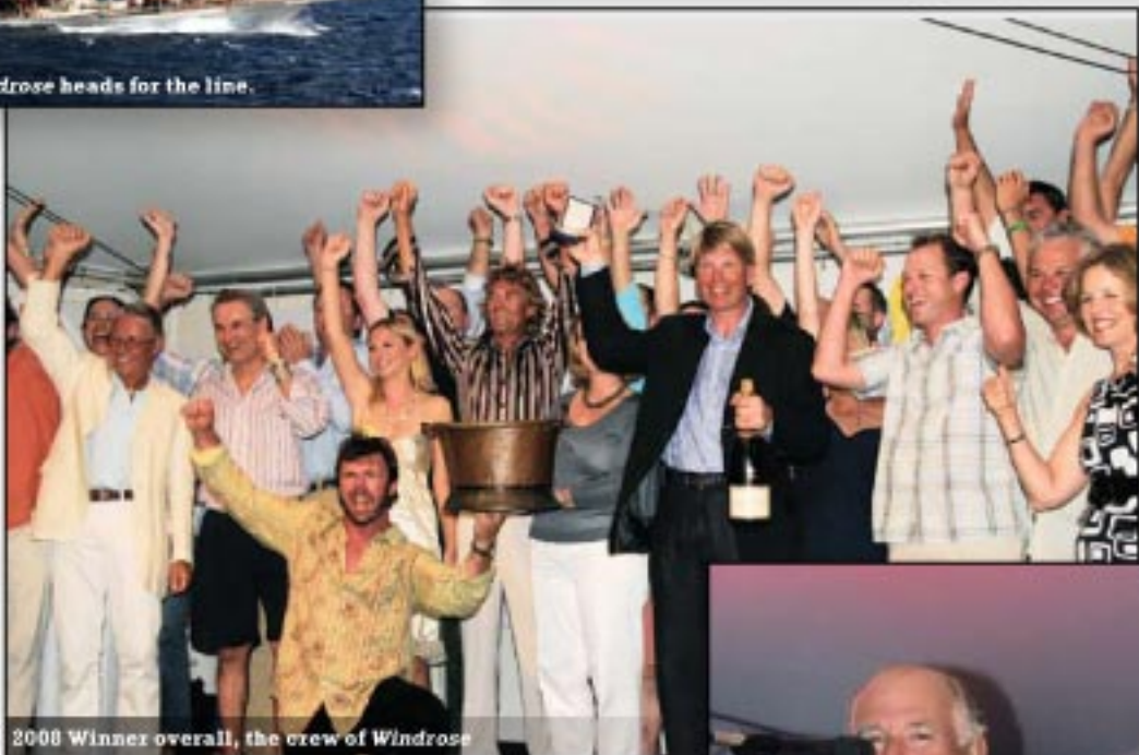
2008 Winner overall, the crew of Windrose