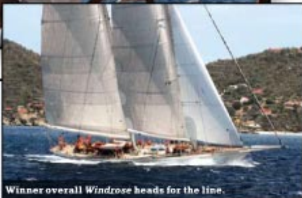
Winner overall Windrose heads for the line.