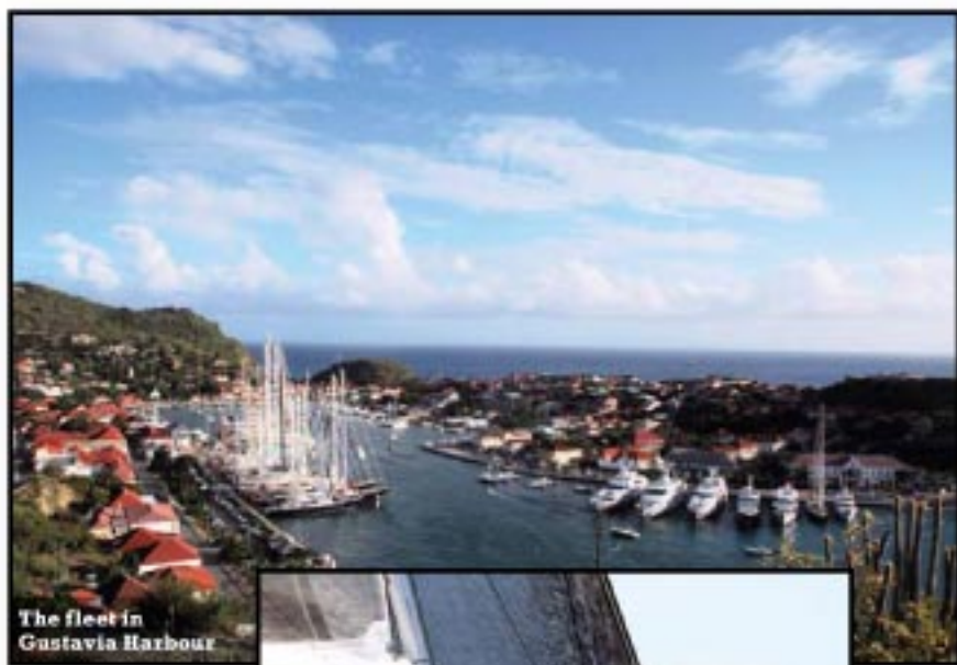
The fleet in Gustavia Harbour