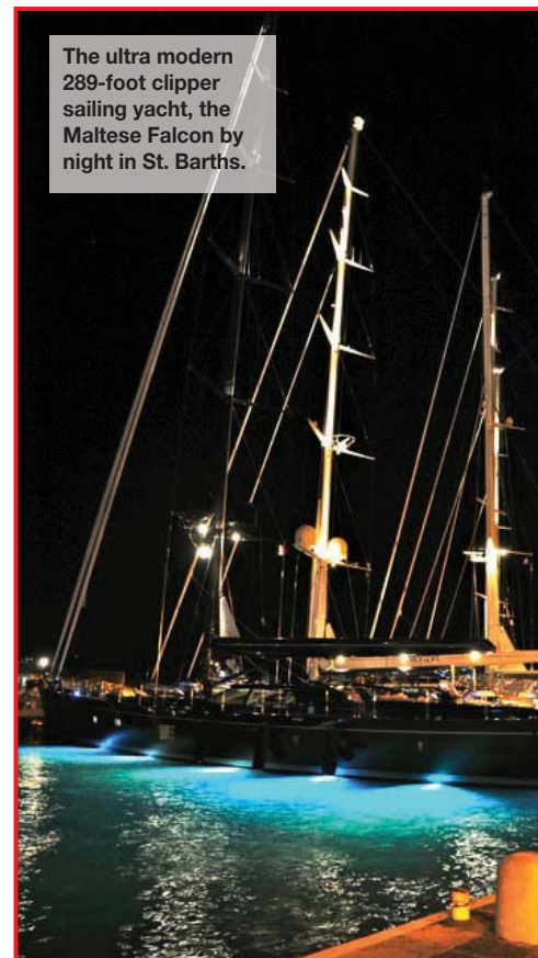
The ultra modern 289-foot clipper sailing yacht, the Maltese Falcon by night in St. Barths.