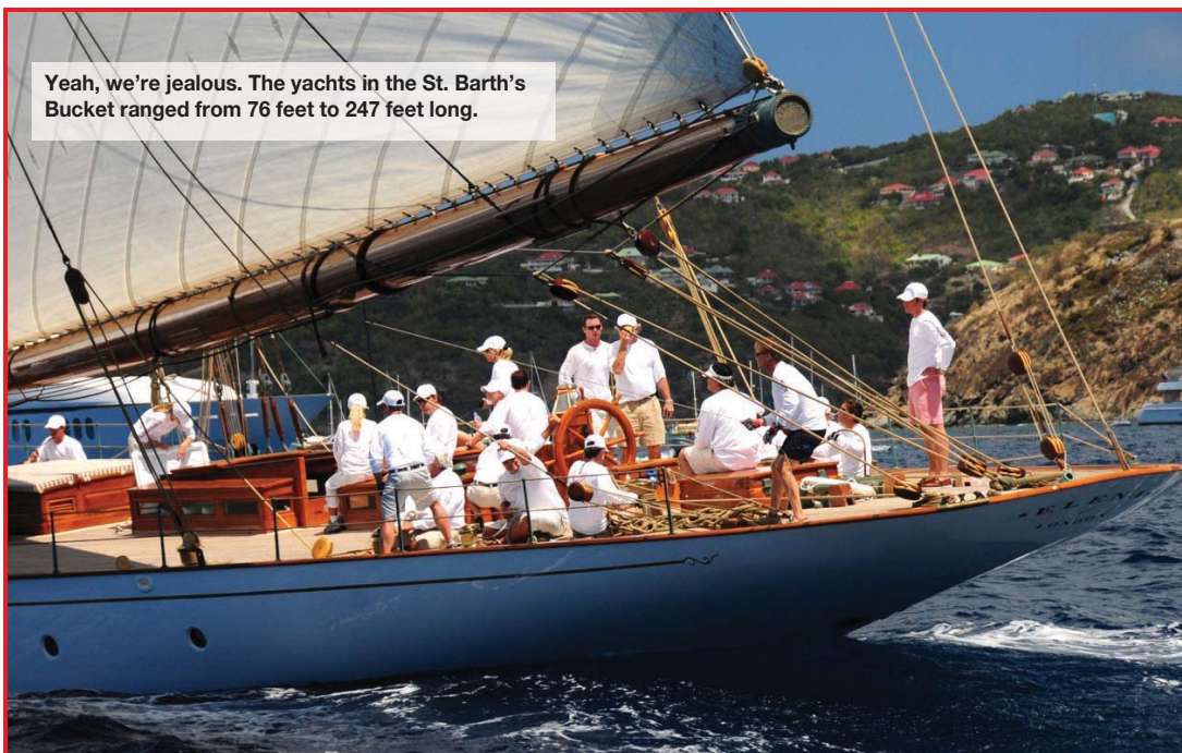
Yeah, we're jealous. The yachts in the St. Barths Bucket ranged from 76 feet to 247 feet long.